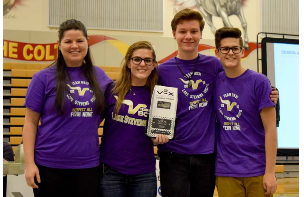
Lake Stevens High School's Team Trifecta won the Design Award and qualified for the World Championship Tournament in Louisville, Ky.

More than 200 high school students from all over Washington state descended upon Cavalero Mid High School on March 5 for the All Washington High School VEX Robotics Championship. Their mission? To qualify for the World Championship Tournament in Louisville, Ky. Fifty-seven teams from 21 different clubs or schools came together for a non-stop, action-packed day of competition where they battled against each other with robots created from the VEX Robotics Design System. Participants played the game Nothing but Net, developed by VEX Robotics, Inc. and the Robotics Education & Competition (REC) Foundation.